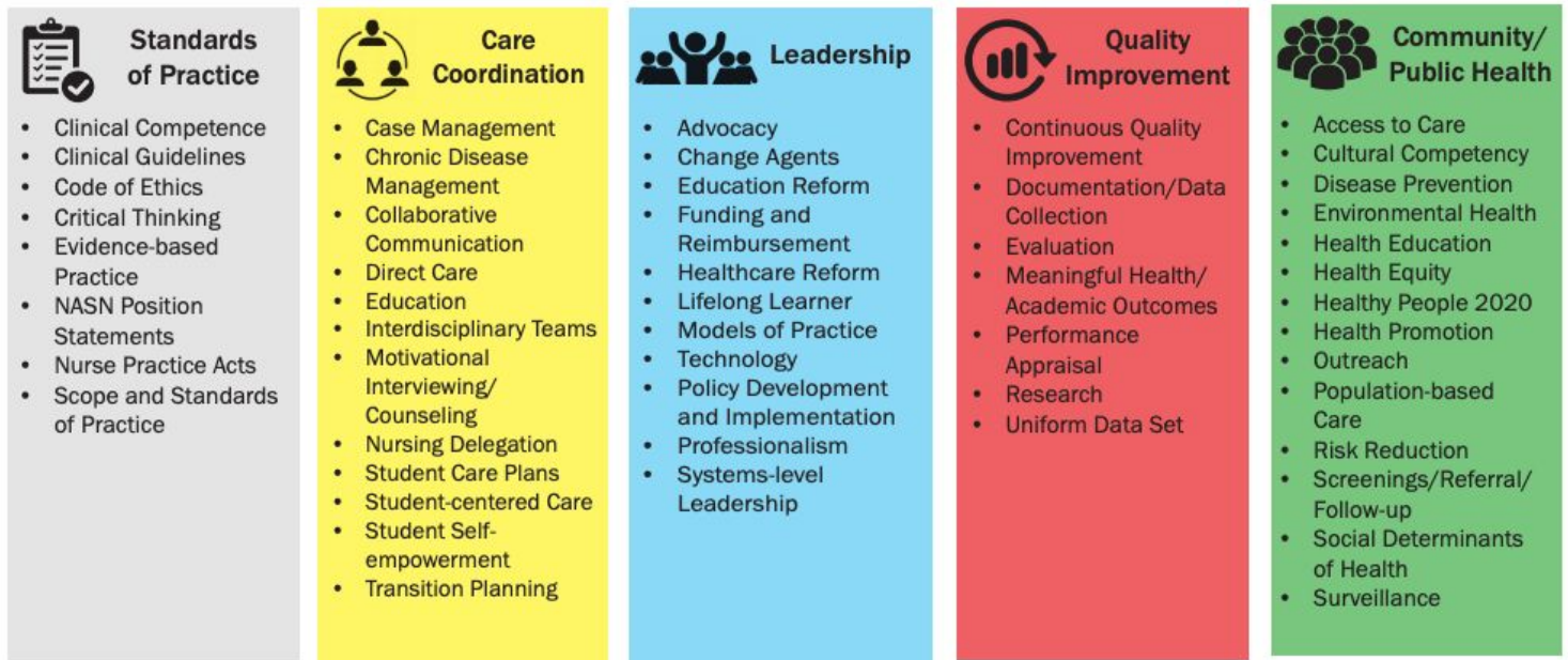
NASN Framework for 21st Century School Nursing Practice